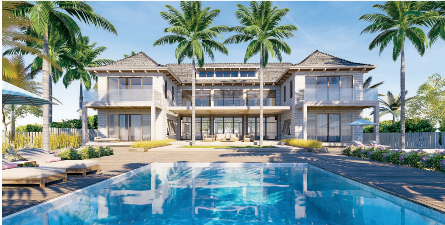
Bungalow Style, Pool Elevation

The largest and most versatile of the Barbuda Ocean Club homes, this two-story, seven-bedroom home features a Great Room with a soaring double-height ceiling centered between the two bedroom wings. Courtyard terraces extend out on both the entry and ocean sides of the home to provide best-in-class indoor/outdoor living. The living, dining and kitchen areas are framed on each side by double downstairs master suites. Upstairs bedrooms are connected by a dramatic sky bridge.