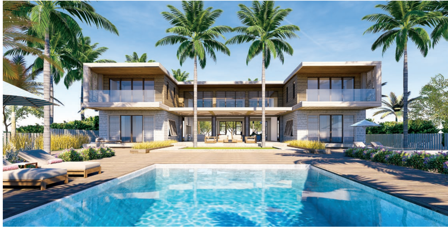
Contemporary Style, Pool Elevation