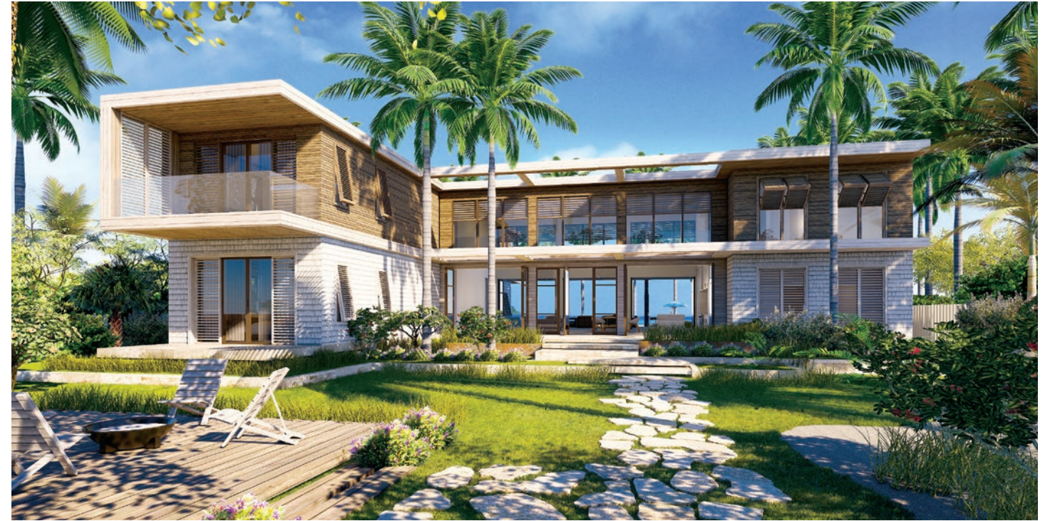
Contemporary Style, Courtyard Elevation