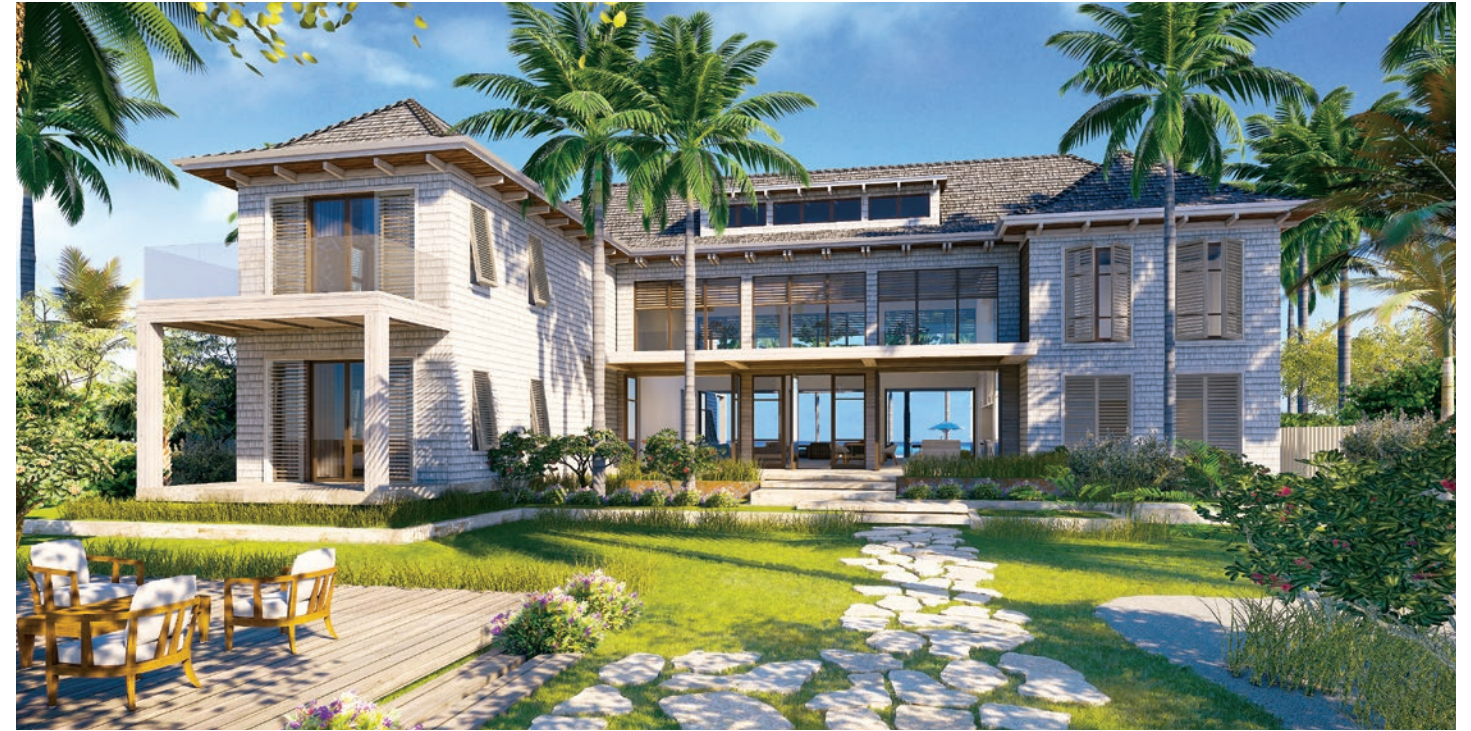
Bungalow Style, Courtyard Elevation